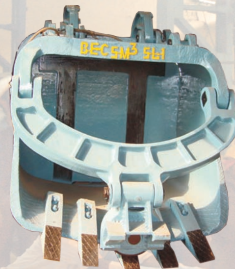
4,6/5 Cu. Mtr. Bucket