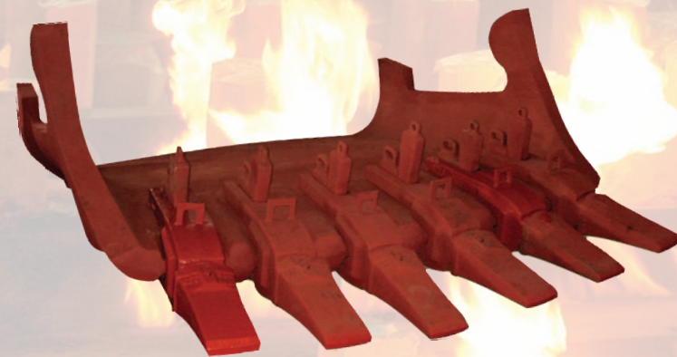
Dipper Front Wall