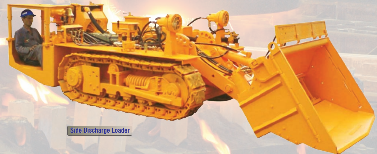
Side Discharge Loader

BEC provides complete cast solutions from Design to Delivery for GET's. BEC is an emerging Global leader in manufacture & supply of Manganese steel & Alloy steel Castings. BEC wear package solution for Mining & Aggregate industries ensures complete interchangeability with assured performance.