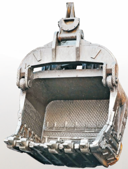
10 Cu. Mtr. Shovel Bucket

BEC wear package solution for Mining & Aggregate industries ensures complete interchangeability with assured performance. BEC provides complete cast solutions from Design to Delivery for GET's. BEC is an emerging Global leader in manufacture & supply of Manganese steel & Alloy steel castings.