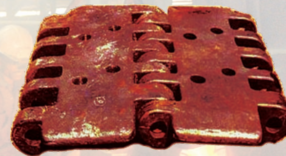
Track Pads in Assembled Condition